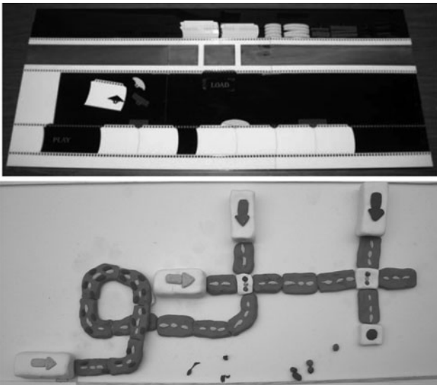
Fig. 5. Low-fidelity prototypes of (top) the TVE system and (bottom) the traffic flow simulator (from laser cut acrylic and modeling clay).

Microprocessors and project boards. Building a project using a microprocessor emphasizes the embedded aspect of tangible interaction. Students in our class have used two different types of embedded technology: the Handy Board and the LEGO® MINDSTORMS® RCX. Both are cross-platform, easy to use, and provide excellent solutions for educational projects with limited input/output requirements. Two relatively new technology platforms are also now available, which we will incorporate into future classes. The first is the LEGO MINDSTORMS NXT kit, which has more sophisticated capabilities than its predecessor, including servo motor drivers and a variety of sensors such as a sonar range finder and a sound sensor. The second is the Arduino Diecimila ( http://www.arduino.cc ), an inexpensive, open-source prototyping platform that can be programmed directly through a USB cable using a PC or a Macintosh.