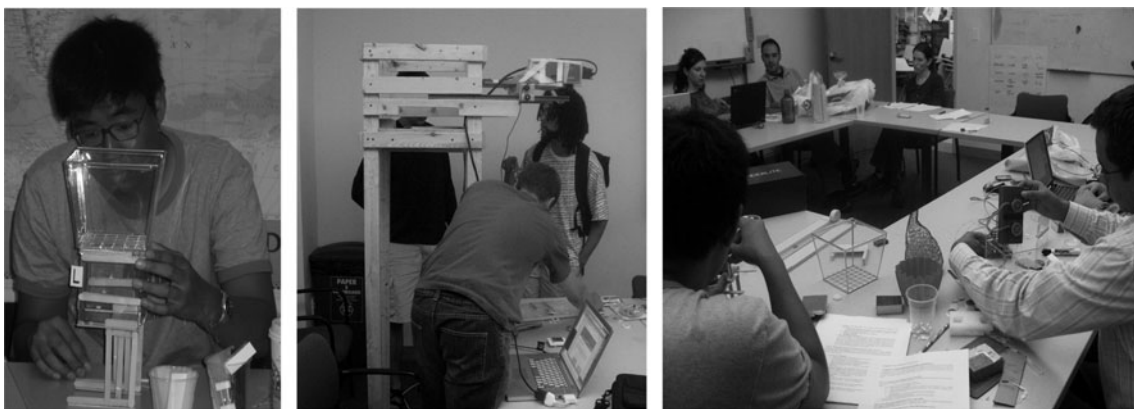
Fig. 3. Students in the TUI laboratory course.

A practical challenge we face in offering the course is the lack of a dedicated laboratory space where students can design, build, and test their interfaces. Our solution involves dividing the course sessions between a conference room and our relatively small HCI research lab. The conference room