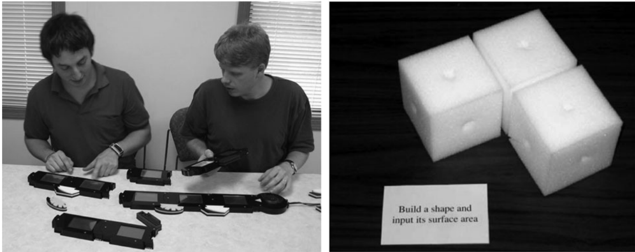
Fig. 1. (Left) The TVE system facilitates collaborative video editing, and (right) the Smart Blocks system allows users to explore concepts of volume and surface area.

prototyping, employing materials such as clay, foam core, and laser cut acrylic. Each successive low-fidelity prototype explored aspects of the physical design of tokens and ways in which they could be combined and constrained. In addition, even though the underlying technology of the project was replaced multiple times throughout the design process (an early prototype used computer vision to track tokens combined with a video projector to augment passive tokens), the core design concepts persisted.