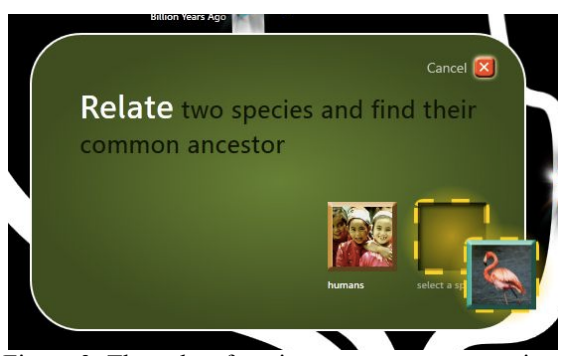
Figure 3: The relate function compares two species.

Gabrielle: Against a four-legged animal, ok.